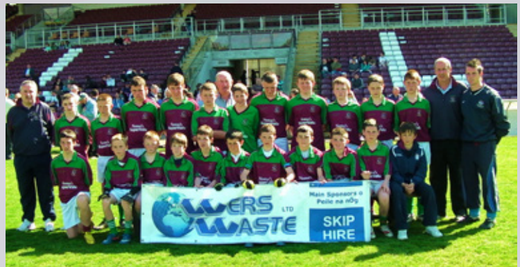
U14 Feile A Finalists Runners up 2011