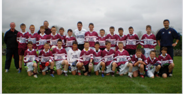
St. James' U14 Feile B finalists Runners up 2007