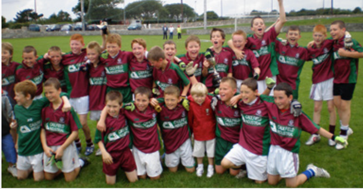
St. James' U12 City 'B' League Winners 2007