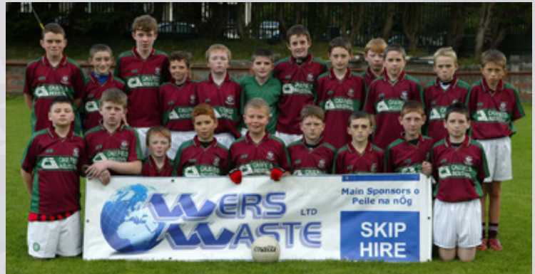
St. James' U12 County 'B' League Winners 2009