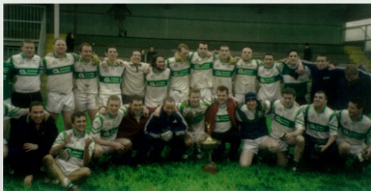
St. James' Junior A West Board & County Championship Winners 2002