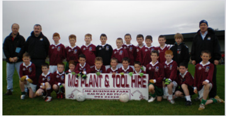
St. James' U12 County 'B' League Winners 2007