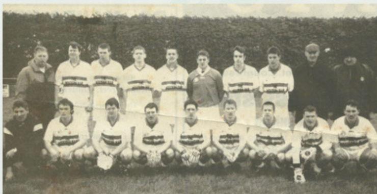
St. James' Junior A County League Winners 1999