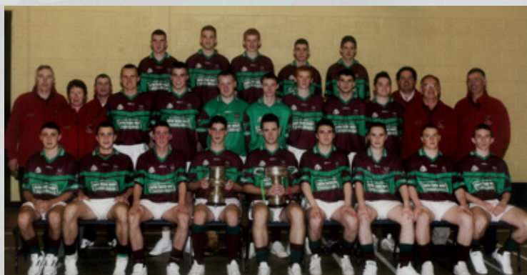
St. James' Minor A West Board and County Championship Winners 2007