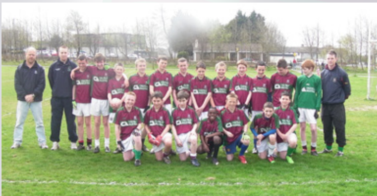
St. James' U14 Feile B Finalists & County B League Runners up 2010