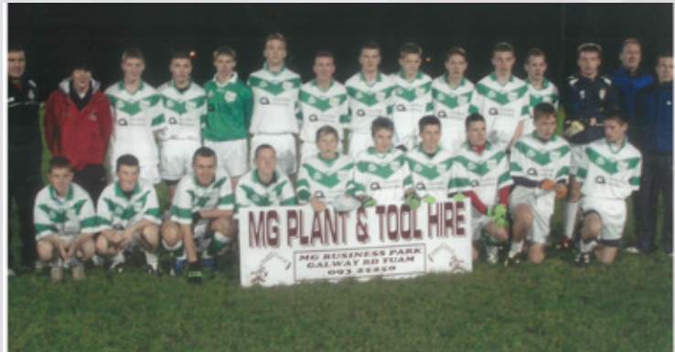
St. James' U16 A League Shield Finalists Runners up 2008