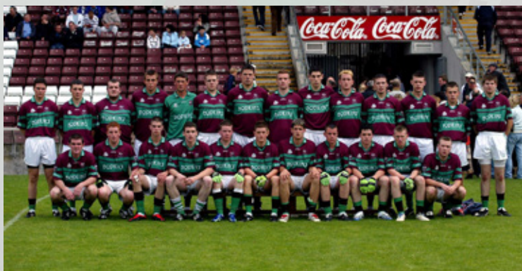
St. James' Minor A West Board and County Championship Winners & County League Winners 2006