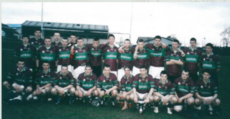
St. James; U-17 A City League Winners 2005