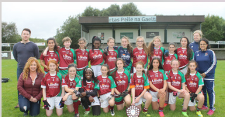
St. James' U14 County E Championship Shield Winners 2017