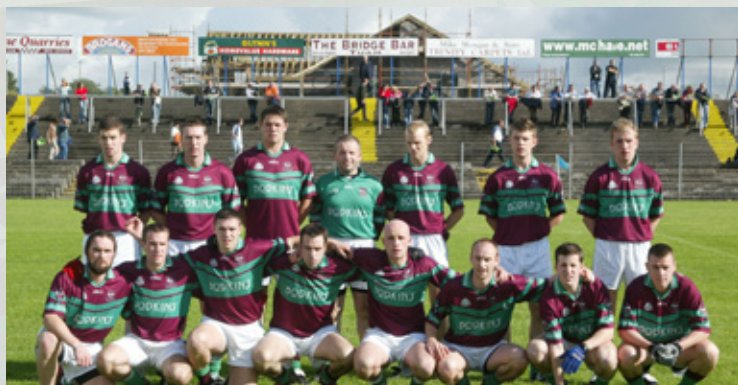
St. James' Intermediate Championship finalists Runners up 2006